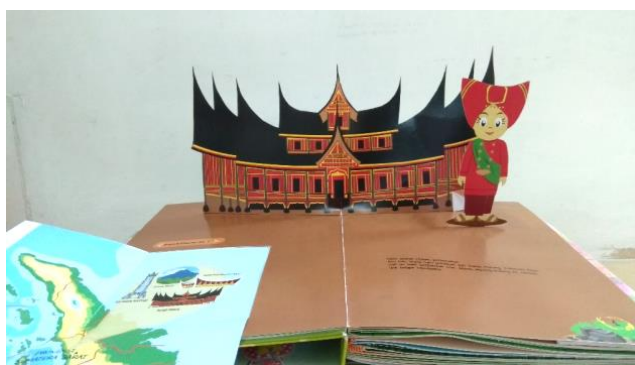
Figure 1. Pages in Movable Book

This was the stage of making movable books, which consisted of making draft designs in the form of story boards, completing illustrations that were tailored to the material science process skills, printing, assembling movable book mechanical elements, and bringing together mechanical elements on each page and cover. After completing the production, the movable books were handed over to be assessed for validity by media experts and subject-matter experts before testing the books.